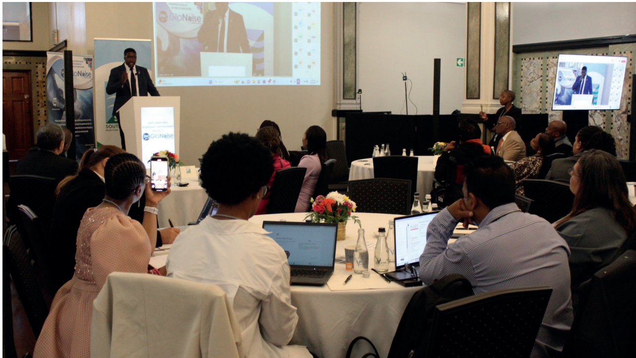
Photo: Speech by Deputy Minister of Transport, Mr. Mkhuleko Hlengwa 'Our Ocean, Our Obligation, Our Opportunity' is the IMO's World Maritime Day theme for 2025, which will culminate in the celebration of World Maritime Day on 25 September 2025.